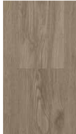
Nostalgic Oak Mocha 60001899