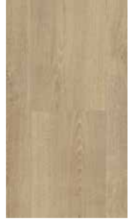
Serene Oak Gold 60001892