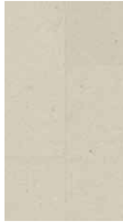
Vibrant Stone Dune 60001903