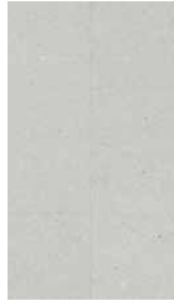
Vibrant Stone Powder 60001902