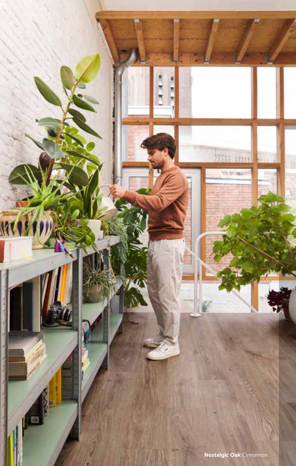
Nostalgic Oak Cinnamon