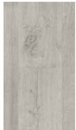
Serene Oak Pearl 60001895