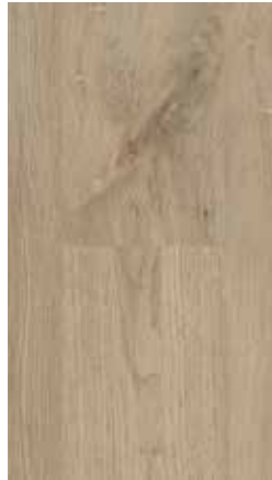
Nostalgic Oak Latte 60001898