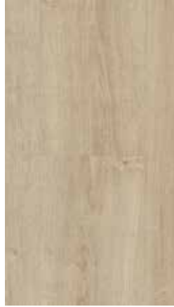
Serene Oak Blonde 60001891