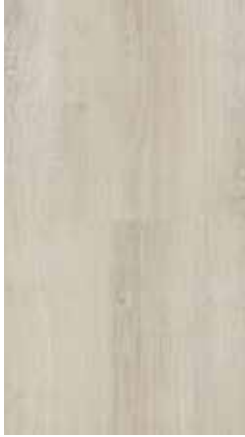
Serene Oak Cream 60001890