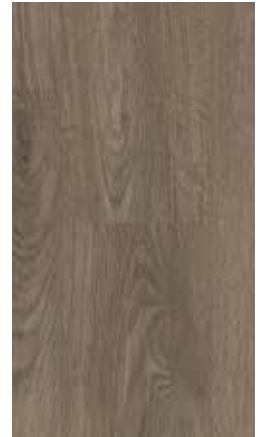
Nostalgic Oak Cinnamon 60001900