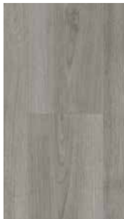
Serene Oak Smoke 60001894