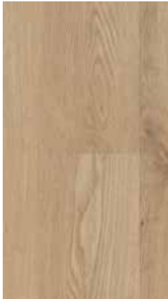
Nostalgic Oak Honey 60001897