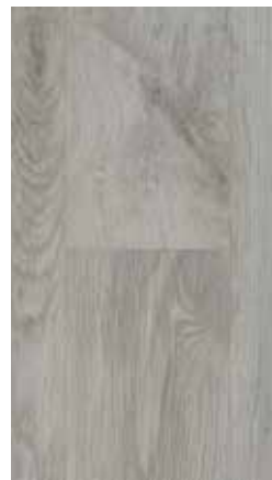
Nostalgic Oak Ash 60001901