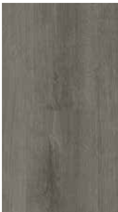
Serene Oak Coffee 60001893