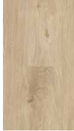
Nostalgic Oak Sand 60001896